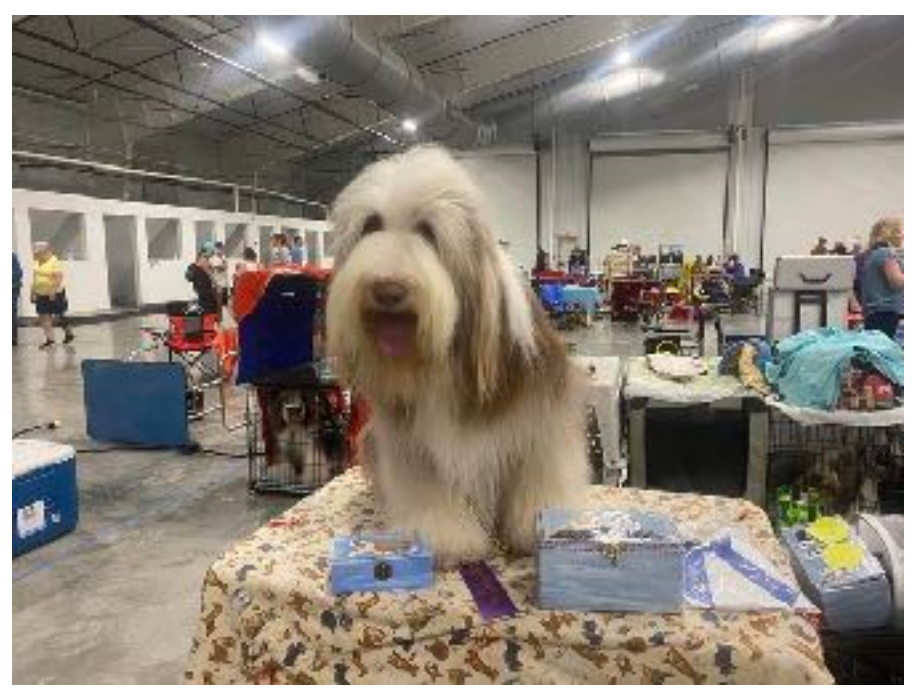
RunningMtn Little Yellow Jacket, Bodee, who crossed over and earned a major by going WD/BOW

Chiffon won her first grand championship points with a bang today! She earned a 5 point major.